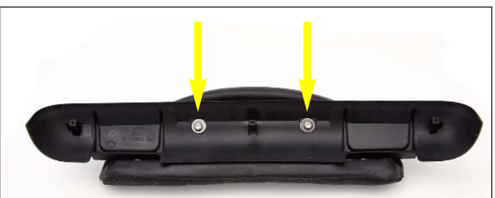
Drill 2-5/16" holes, then install the Corbin top pad and<br/>secure with the supplied Allen boltsFIG 2and flat washers.